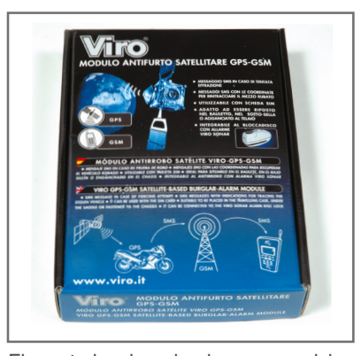
Elegant visual packaging summarizing product main technical and operational features. It can be hanged vertically by means of the apposite buttonhole