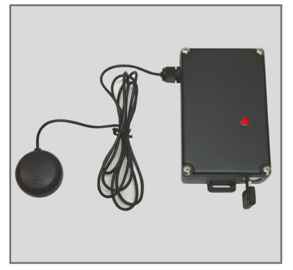
LED indicator confirming the operations. Detailed user instructions, placed under the Module itself

Technological and versatile, recommended for keeping any means of transport to which it is applied under control; perfect if combined with alarm disc lock Viro Sonar, safe and resistant in the locking of any type of scooters or motorbikes, especially of high powered ones