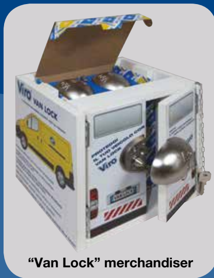
“Van Lock” merchandiser

Body: one-piece, electropolished stainless steel, oval shape without edges.